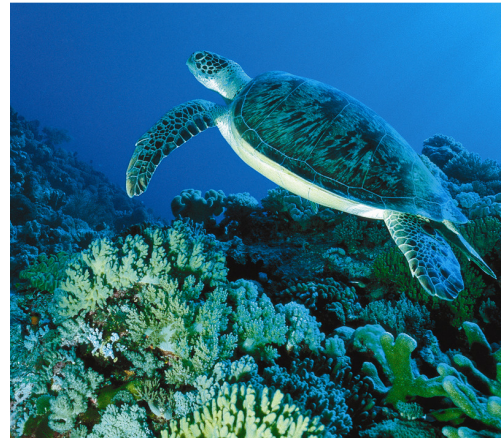
The Coral Triangle is home to six of the seven species of marine turtle.

Within the broad framework of the CTI Plan of Action, the CT6 countries are developing national strategies and action plans and are working together to identify and implement those actions that require regional cooperation. The CTI thus encompasses a distinctively regional approach, building on country-driven priorities and actions.